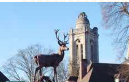
Place du Chalet, bronze deer, copy of a statue of Pierre-Louis Rouillard (19 th ).