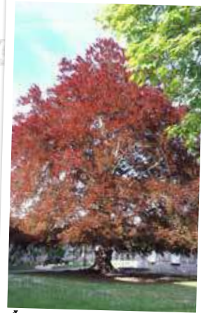
Copper beech in the park of the royal palace